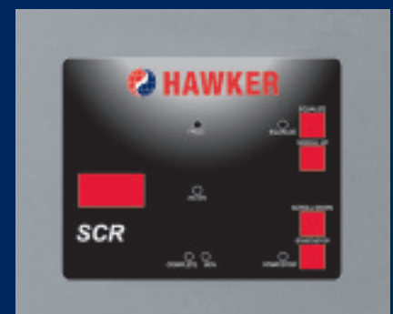
Below – Control panel is easy to read and operate.